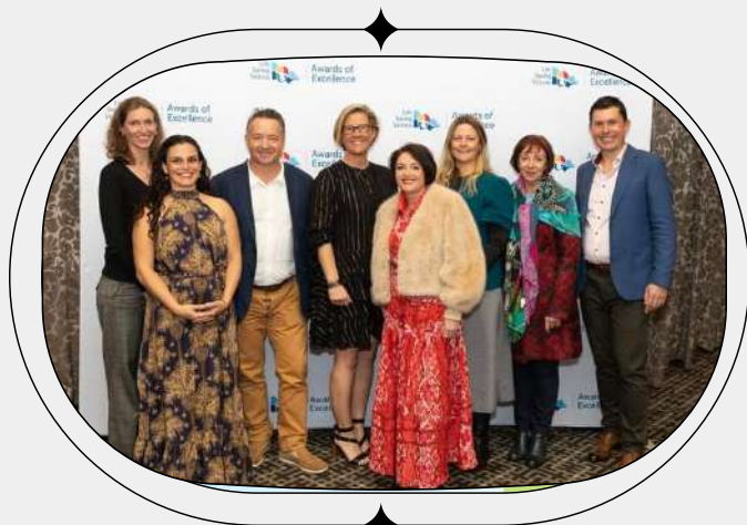
Pictured: Members of the Board and Silver Salties team at the LSV Awards of Excellence.